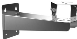
DS-1701ZJ Wall Mounting Bracket